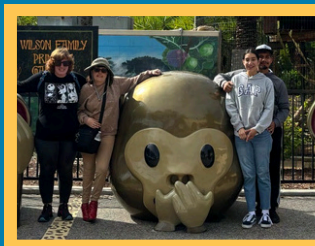
Memory Photos See more on page 3.