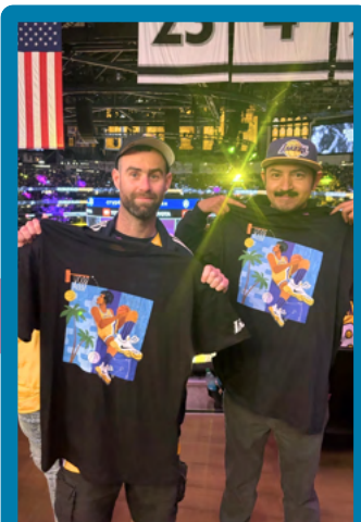
Cheering on the Lakers!