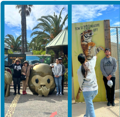
Visiting the Moorpark Teaching Zoo!