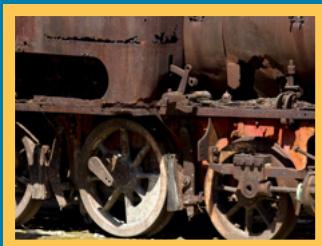
Great Train Show View more 805 Connects activities on page 2.